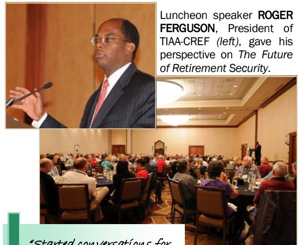
Luncheon speaker ROGER FERGUSON , President of TIAA-CREF (left), gave his perspective on The Future of Retirement Security .

"Started conversations for many trustees, both pro and con..."